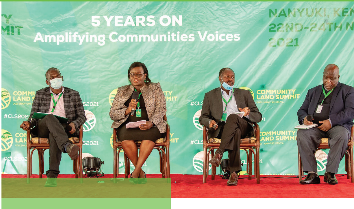
Multi-sectoral panel of experts giving their submissions on the progress of the implementation of the Community Land Act 2016.