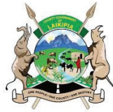
County Government of Laikipia