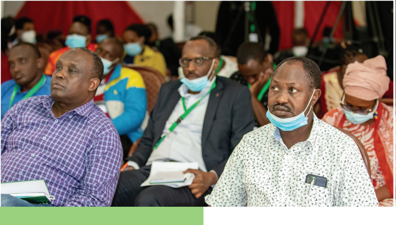
Delegates at the Community Land Summit, 2021 following proceedings, as communities congregated to reflect on the status of the implementation of the Community Land Act 2016, five years on.

the election and activities of Community Land Management Committees and preparation of bi-laws.