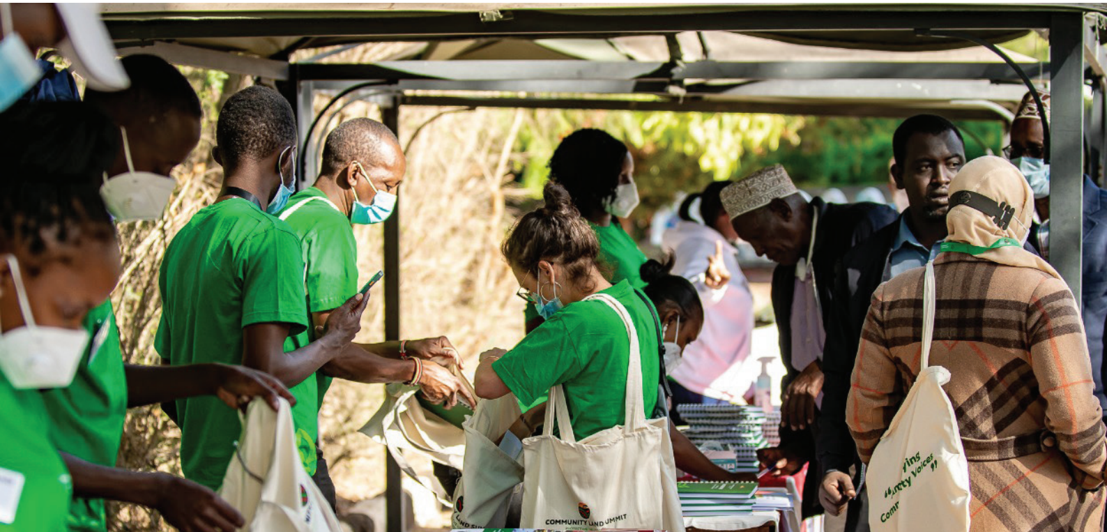
Delegates from 19 counties in Kenya, registering at the first Community Land Summit held at Sportsman Arms Hotel in Nanyuki.

The Summit concluded with observations from participants who: