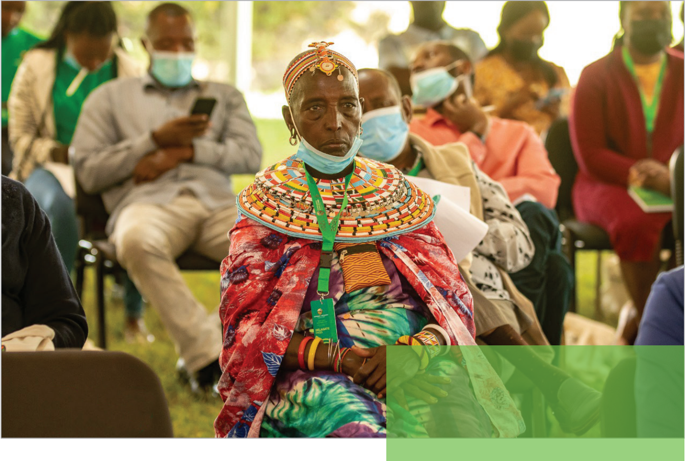
Participants at the Community Land Summit 2021, keenly following the deliberations at the Sportsman Arms Hotel in Nanyuki.